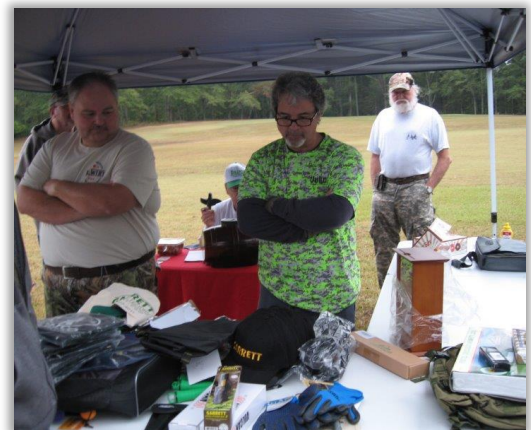
Lot's of prizes