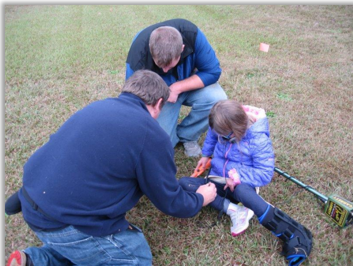
"Now dad, this is a pinpointer and this is how it works"