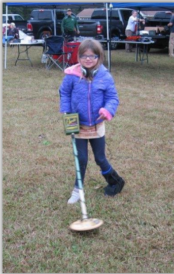
Ready to get the show started