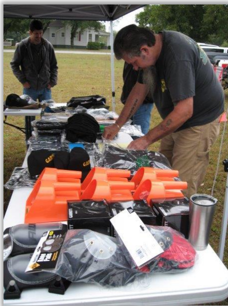
Double Checking the token list