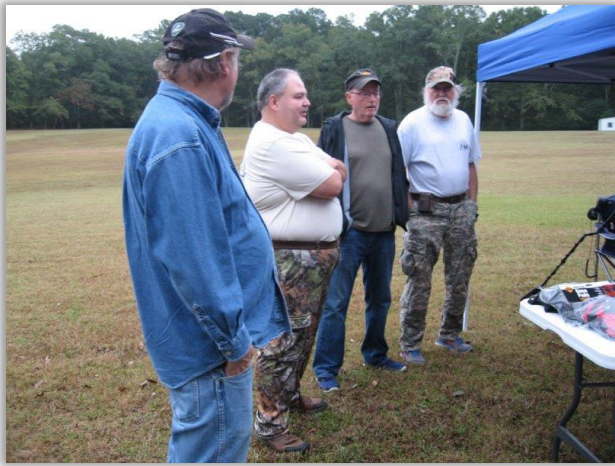
More strategy meetings