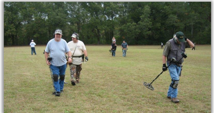
Time to count the coins!